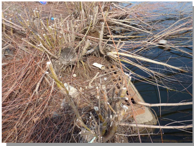
Overgrown vegetation interfering with basin outlet

To assess malfunctioning basins, the study first identified issues affecting basin performance.