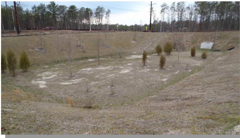
One of the stormwater basins evaluated

In January 2011, Governor Christie signed into law Bill A-3606, which requires the State Department of Transportation to inventory and assess state-owned stormwater basins in the Barnegat Bay Watershed. Known as Public Law 2010, Chapter 114 (P.L. 2010, c. 114), the Act specifically requires the Department of Transportation (NJDOT), to conduct a study of all stormwater basins owned by NJDOT, the New Jersey Transit Corporation (Transit), or the New Jersey Turnpike Authority (NJTA), which are located in the Barnegat Bay Watershed to identify those that are malfunctioning. NJDOT is further directed to submit to the Governor and the Legislature a list of the malfunctioning basins, prioritized to indicate the order in which they should be repaired, to include the estimated cost for each repair, and to consult with the Department of Treasury.