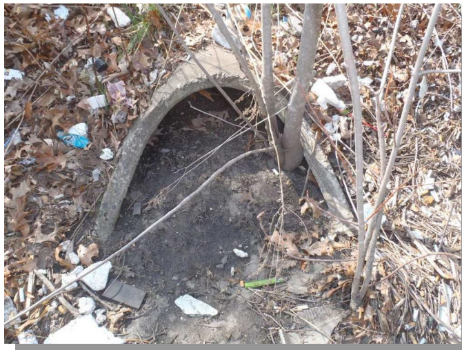
Clogged inlet pipe in urgent need of maintenance