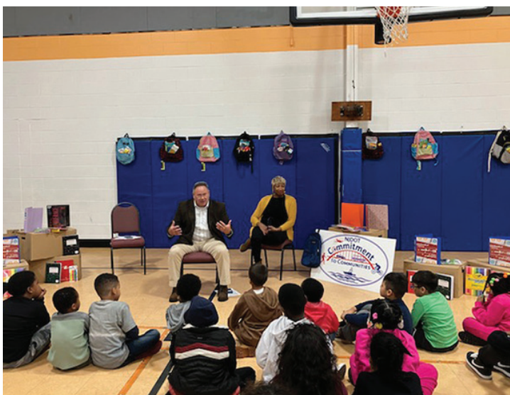
Pictured: School Supply Drive

The generous spirit of NJDOT employees continued to shine throughout 2022, and they continue to go above and beyond their daily responsibilities to help where there is a need. Seeing that commitment in action at NJDOT is a powerful reminder that we play an important role in serving our communities beyond our everyday work duties. I'm inspired by the charities we partner with throughout the state and proud of our employees for helping them fulfill their missions.