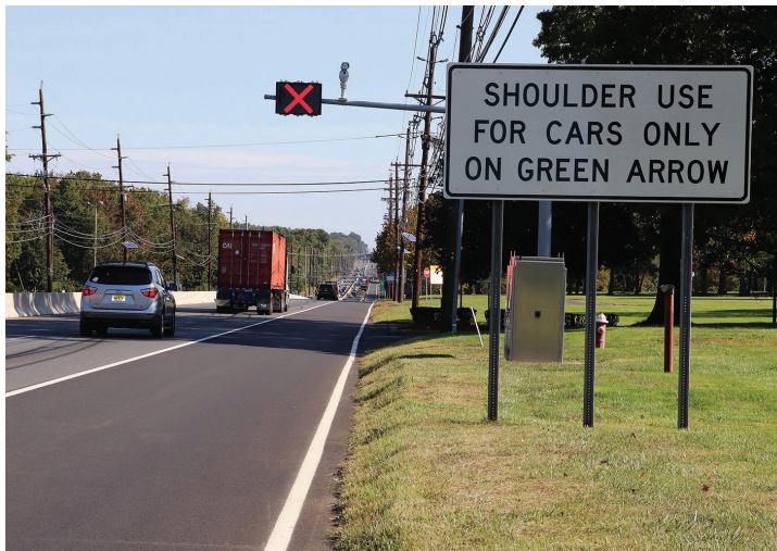
Pictured: Route 1 Hard Shoulder Running Program

NJDOT's Route 1 Hard Shoulder Running Program in South Brunswick, which improved congestion and