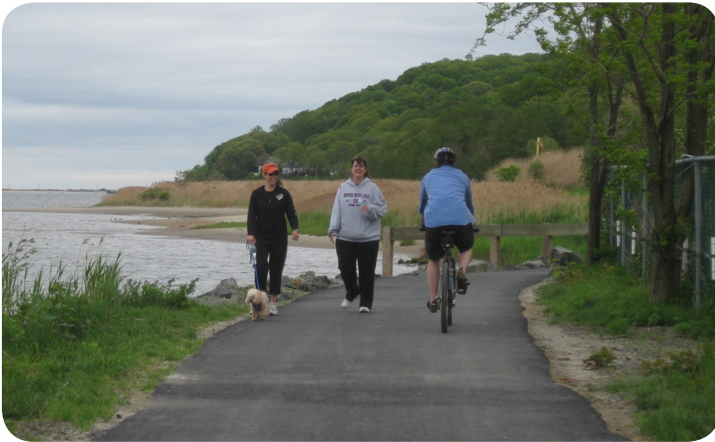
The Henry Hudson Trail in Monmouth County, NJ is an example of a shared use path.

When to Use/Typical Application: 10 feet is the recommended minimum width for a two-way, shared use path on a separate right-of-way; 2 feet of graded area should be maintained adjacent to both sides of the path and 3 feet of clear distance should be maintained between the edge of the trail and lateral obstructions; shared use paths fall under the accessibility requirements of the Americans with Disabilities Act (ADA).