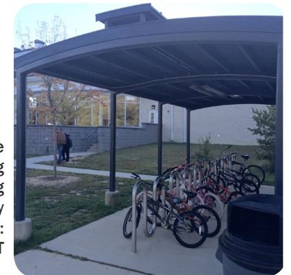
Covered bicycle parking at Egg Harbor's Spragg Elementary School.

The ribbon rack on the left is preferred because unlike the comb rack on the right, it allows both the frame and wheels of the bike to be locked.