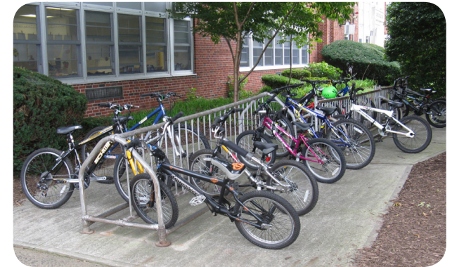
Bicycle parking at Somerville School in Ridgewood, NJ is located on a concrete pad which is visible from within the building.