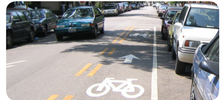
A contra-flow bicycle lane in Chicago, IL.

When to Use/Typical Application: Where it would provide substantial savings in out-of-direction travel and/or direct access to high-use destinations; where there will be fewer conflicts when compared to a route on other streets; when there are few intersecting driveways, alleys, or streets on the side of the street with the contra-flow lane; where bicyclists can effectively and conveniently make transitions at the termini of the lane.