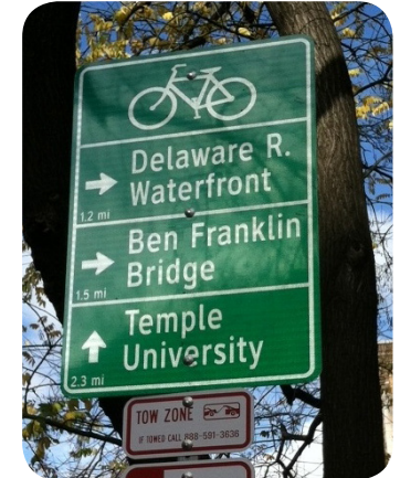
Bike route signs in Philadelphia show distance to destination.

When to Use/Typical Application: Signs are typically placed at decision points along bike routes – typically at the intersection of two or more bikeways and at other key locations leading to and along bicycle routes; signs should be oriented so bicyclists have sufficient time to comprehend the sign and change their course, when needed.