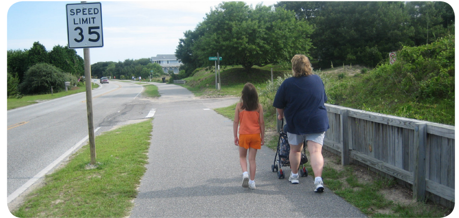
Example of a sidepath.

When to Use/Typical Application: Where right-of-way or other physical constraints prohibit path alignment in independent rights-of-way and there are no practical alternatives for improving the roadway or accommodating bicyclists on nearby parallel streets; when the sidepath can be built with few street and/or driveway crossings; when the adjacent roadway has relatively high-volume and high-speed traffic; the minimum recommended distance between a path and the roadway curb is 5 feet. When the separation is less than 5 feet, a physical barrier or railing should be provided; utilizing or providing a sidewalk as a shared use path is undesirable.