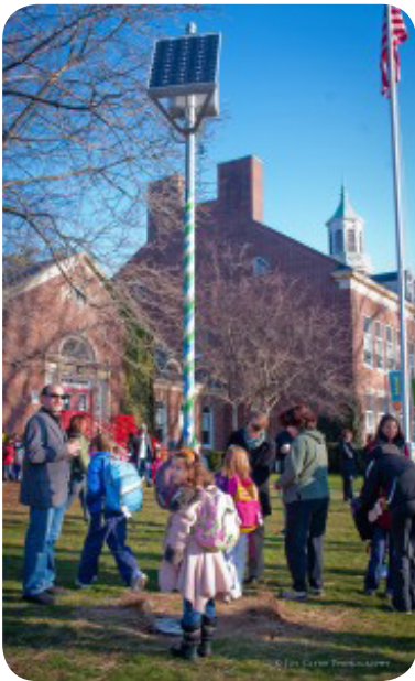
The "zap" machine tracks participants as they arrive at Montclair's Edgemont School as part of the Boltage Program.