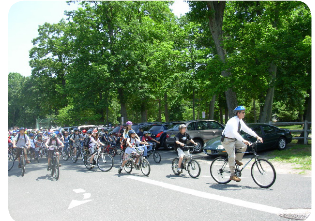
Students bicycling from elementary to middle school on "Transition Day" in Fair Haven, NJ.