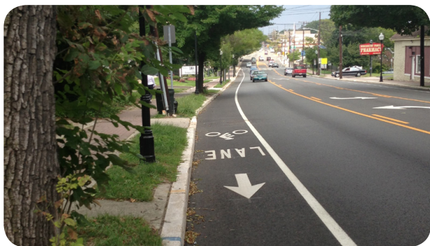
A bike lane along Route 45 in Woodbury, NJ.

When to Use/Typical Application: Bike lanes are most helpful on streets with \geq 3,000 motor vehicle average daily traffic, a posted speed \geq 25 mph, or high transit vehicle volume; they should typically be provided on both sides of two-way streets to prevent wrong-way riding; the preferred width for young cyclists is 5 feet.