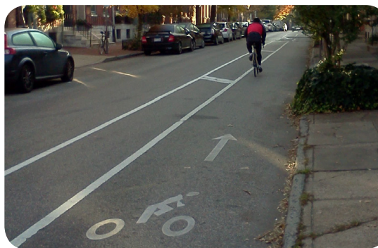
A buffered bike lane in Philadelphia, PA.

When to Use/Typical Application: Buffered bike lanes should be considered on streets with high traffic volume, regular truck traffic, high parking turnover and a speed limit > 35 mph.