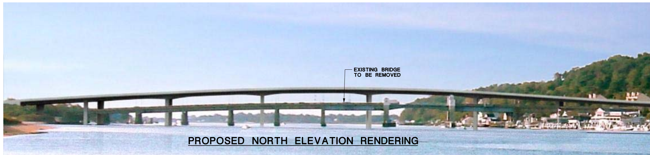
PROPOSED NORTH ELEVATION RENDERING