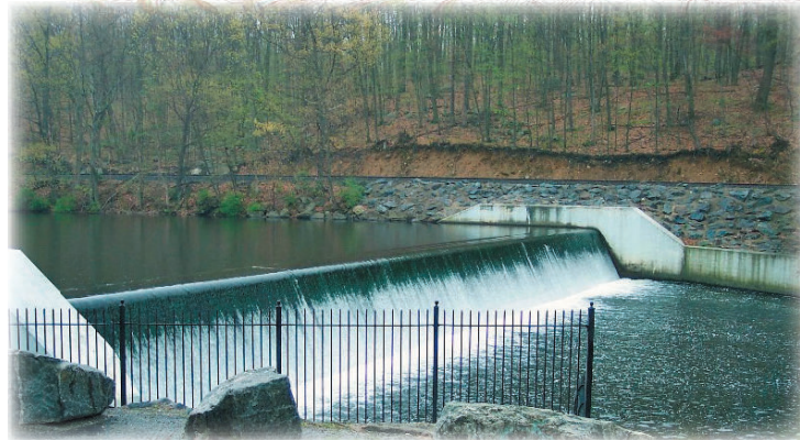
A Morris Canal towpath overlooks Saxon Falls at former Guard Lock 5 West. This is a popular site for fly fishing.

The proposed Warren and Highlands trails will run