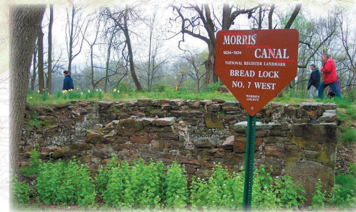
Visitors at the Historic Learning Center at Bread Lock Park hike along the canal right-of-way.

http://www.state.nj.us/transportation/business/localaid/