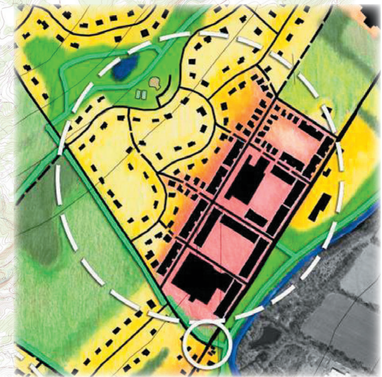
In this conceptual plan, a new town center along Route 57 is bordered by a river greenway with a connector trail leading to a town park.